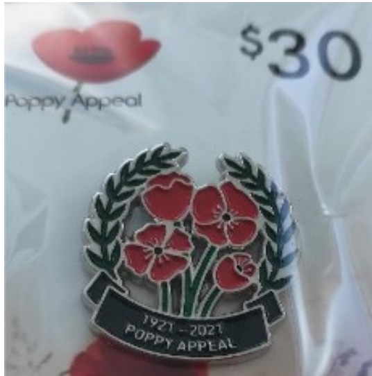
New poppy pin this year